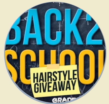
Back to School Events