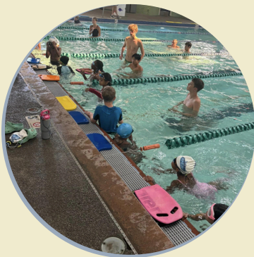
4 Day Swim Clinic